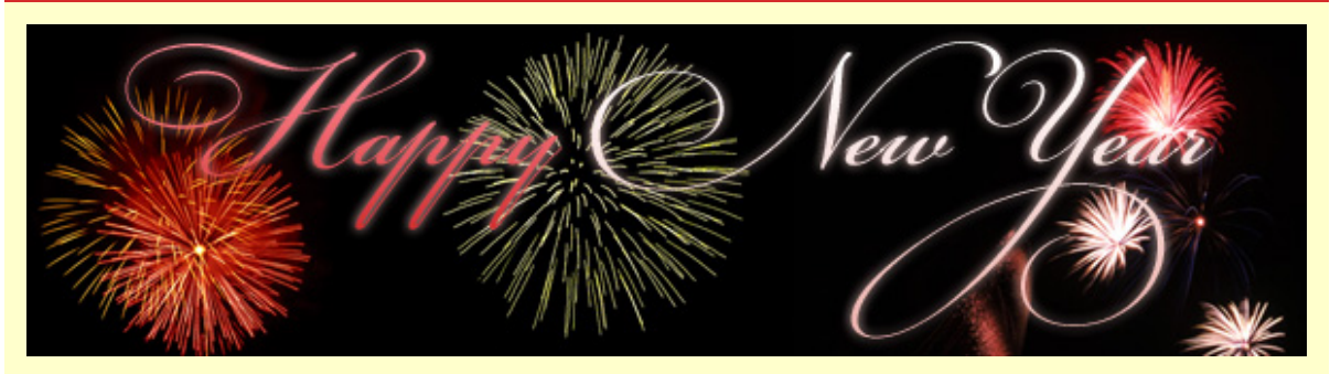
May we all have a happy and peaceful New Year