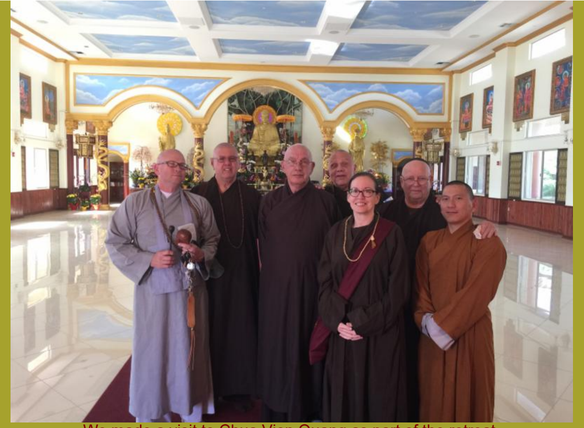
We made a visit to Chua Vien Quang as part of the retreat.