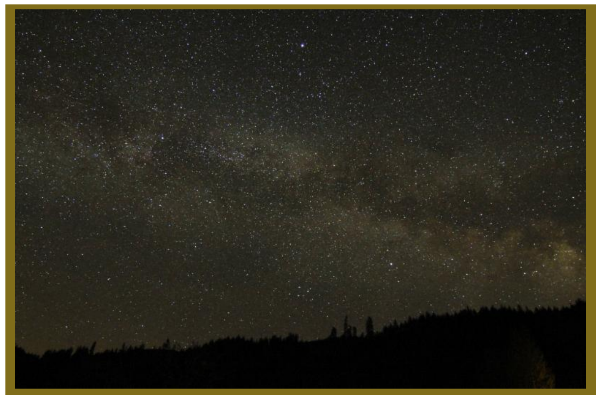
Ven. Miles captured the Milk Way in a photo from our temple during a recent stay here. The beauty of our night sky is really something to look at - it is so very beautiful and humbling.