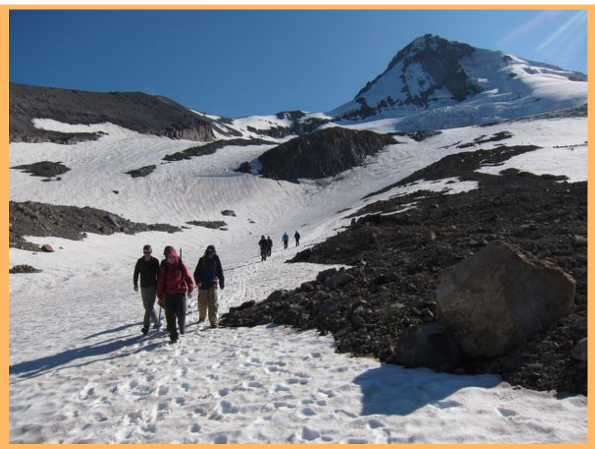
Cascade Mountain School is a Science, Technology, Engineering, and Math (STEM) focused educational program for middle and high school students. It is grounded in community and ecological standards. Trout Lake abbey hosted one group here last summer and the experience was wonderful for the kids attending and our staff.

Contact the school at cascademountainschool.org or 541.645.0688