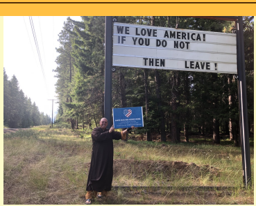
Thay Kozen holds up a sign reminding us to all be kind and