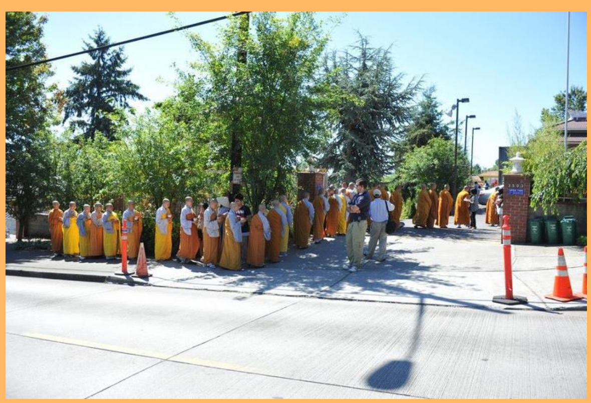
Monks and nuns making alms rounds at Co Lam Pagoda in Seattle