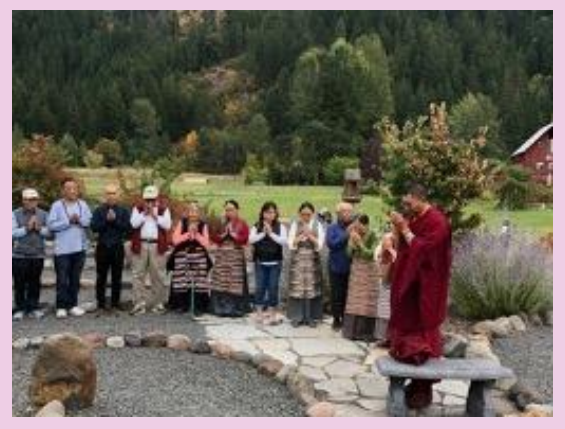
Leading his group in a walking and chanting meditation in our Labyrinth.

Tree planting Green Tara ceremony to honor our Tibetan brothers and sisters. The tree was planted to honor the struggles of the Tibetan people.